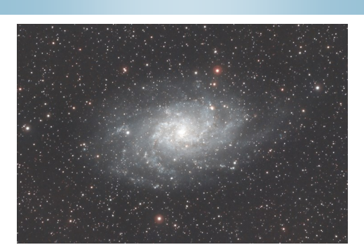
Triangulum Galaxy (M33) 2.73 million light years away